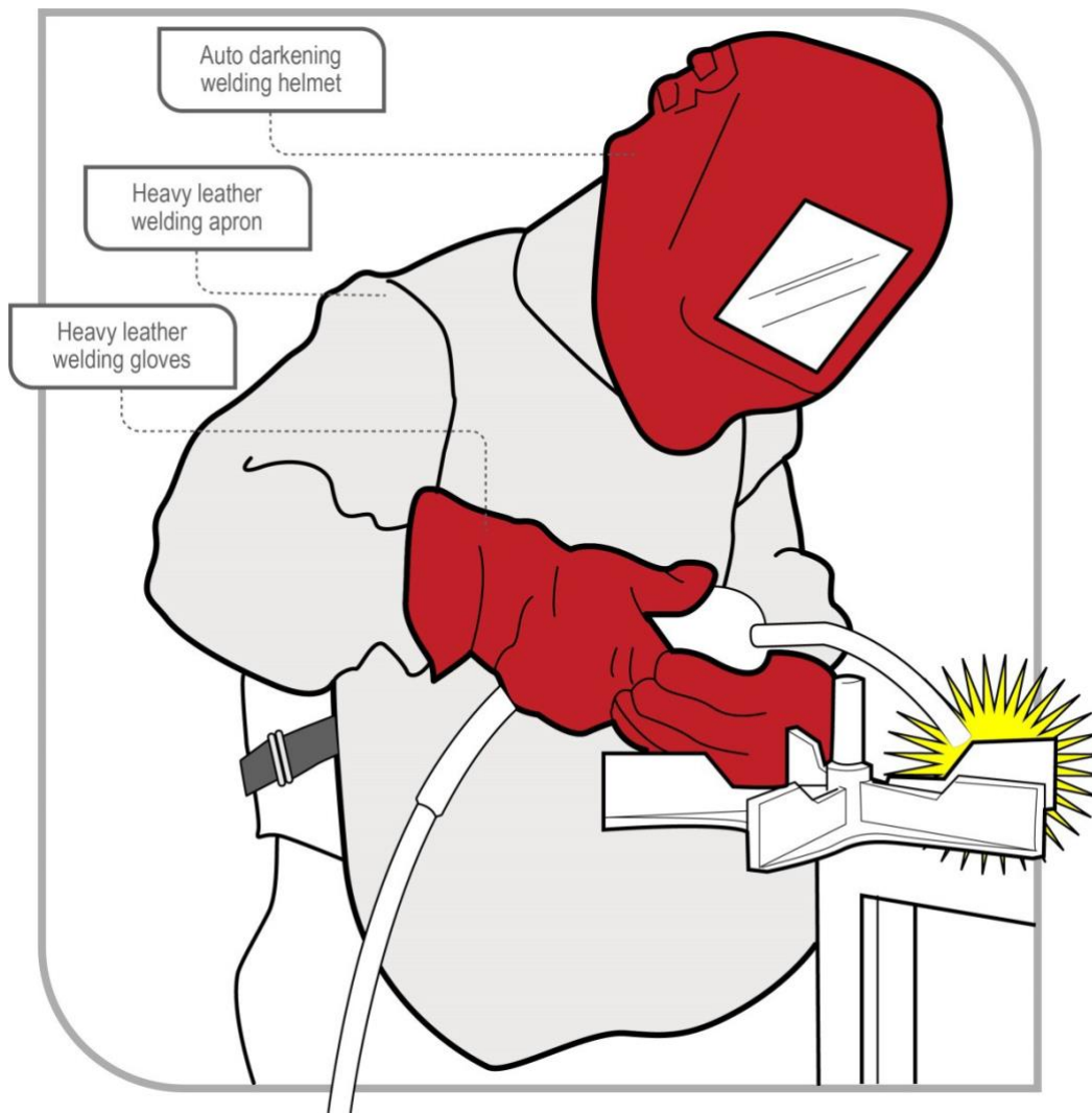
Figure 3 Worker wearing PPE while welding

When PPE is worn by workers, it should not introduce other hazards to the worker, such as musculoskeletal injuries, thermal discomfort, or reduced visual and hearing capacity.