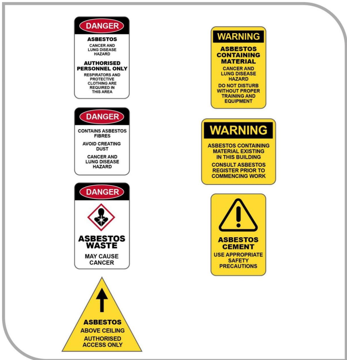
Figure 2 Examples of warning signs for asbestos