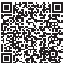
SafeWork Australia's Forklift Guide