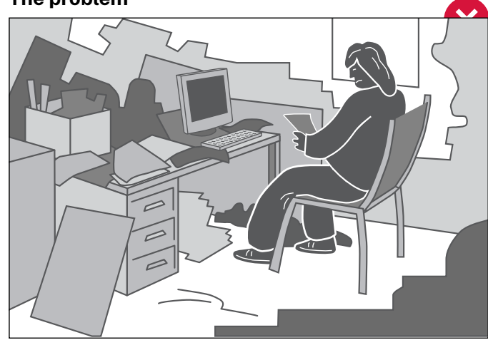
The office is cluttered and has inadequate space under the desk for the worker's legs.