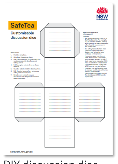
DIY discussion dice