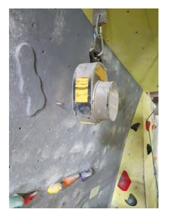
Unit involved in the incident